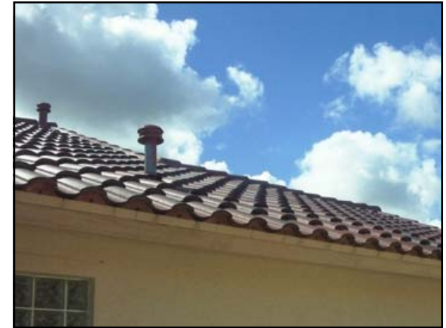
Barrel Tile Treated with Roof-Guard 102™